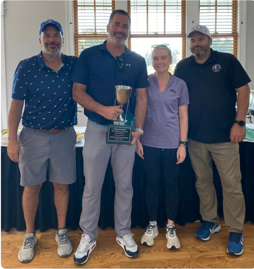
Golf Tournament Champion: Team Musco Lighting